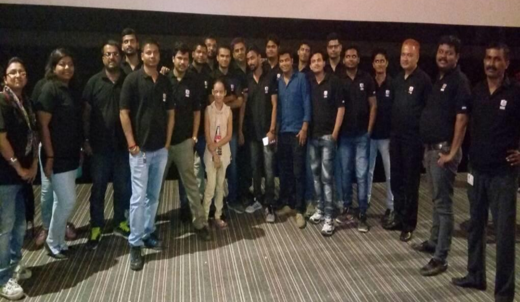
A GROUP PHOTOGRAPH OF ALL THE SISATARIANS ENJOYING MOVIE- HINDI MEDIUM