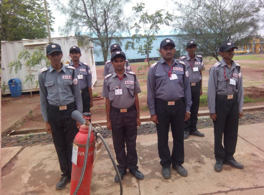
TRAINING OF GUARDS AT TOP-3 DHUVA.