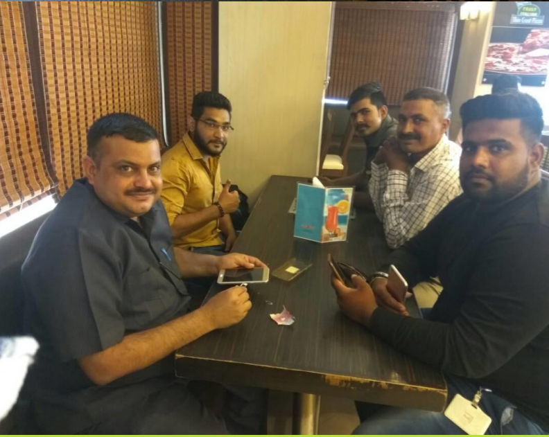
GROUP PHOTOGRAPHS OF ALL SISATARIANS ENJOYING BIRTHDAY CELEBRATION!!!!!!!!!!!!!!