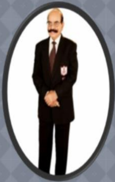
Chak De SISA