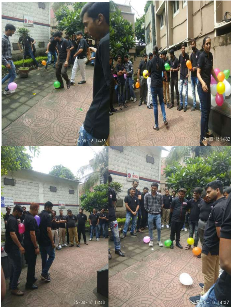
SISATARIANS ENJOYING GAMES ON FUN DAY