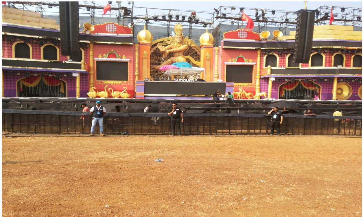
Entrance Gate is secured by SISA Bouncers