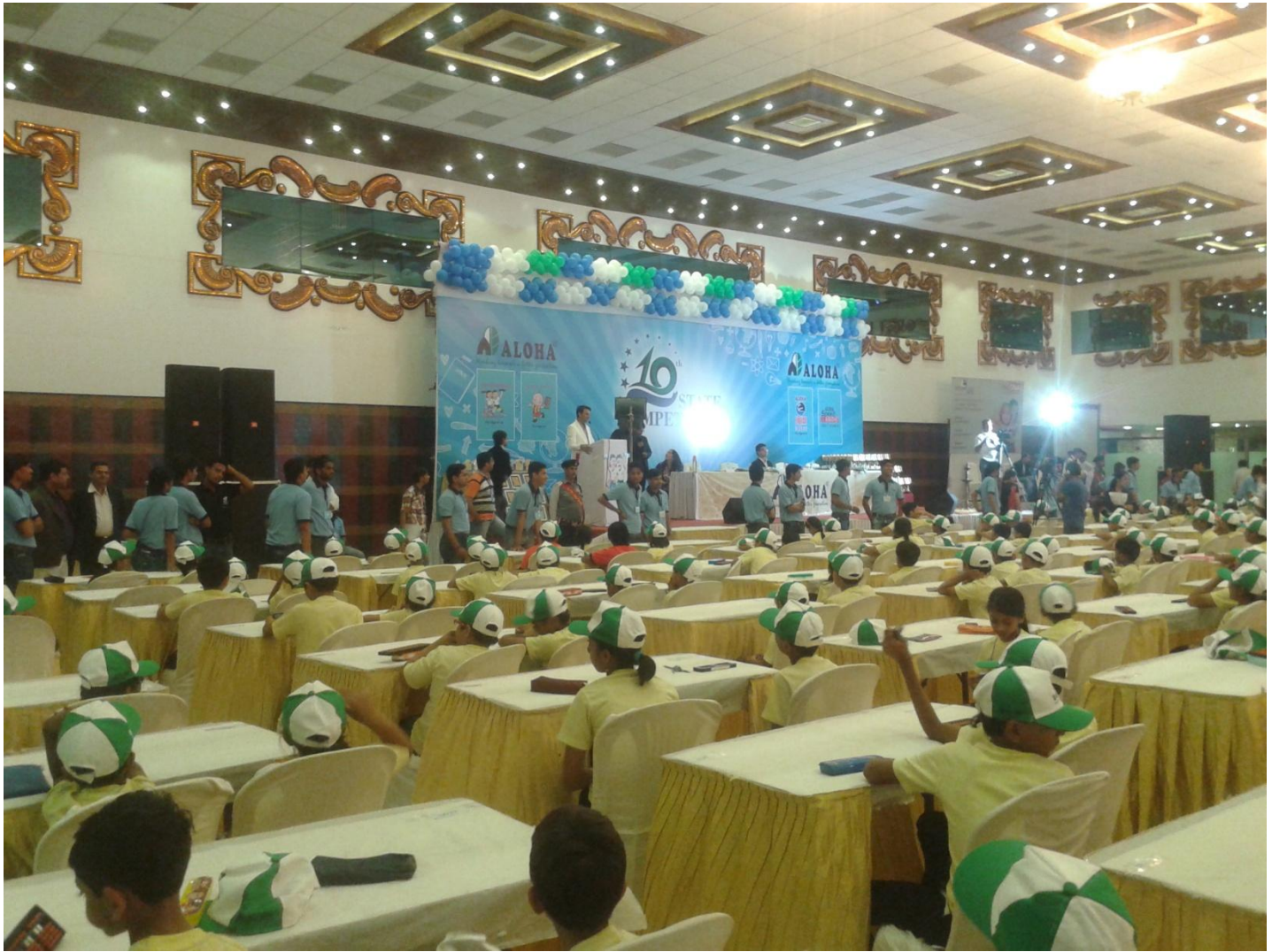
"ALOHA" - A 10th State Competition Organized For Kids.