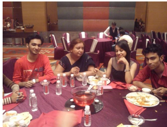
Employees are enjoying the dinner at "The Grand Bhagwati" hotel.