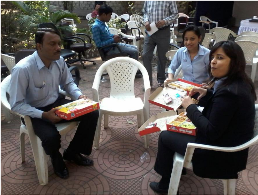
Lunch time at the Training session.