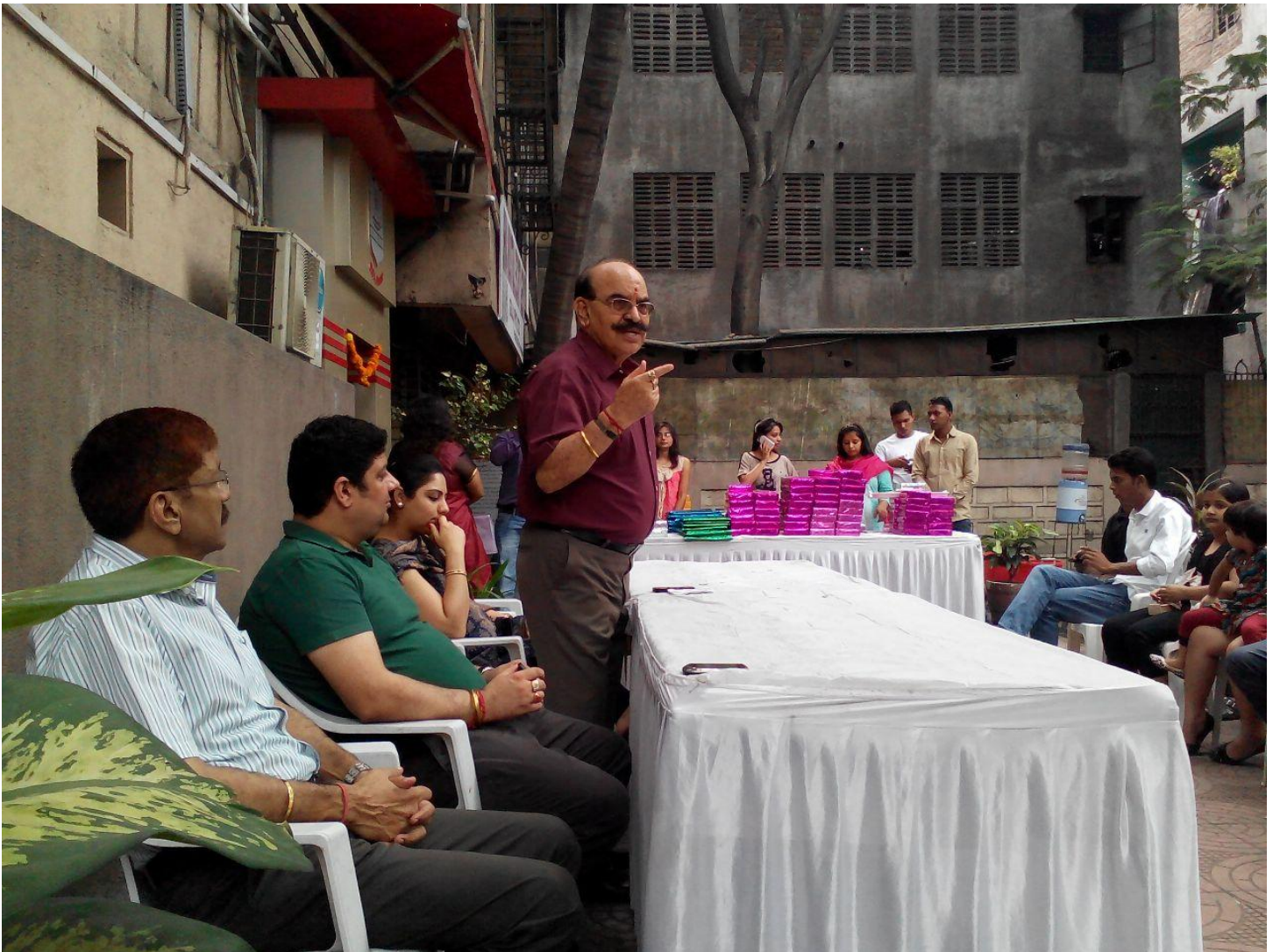
Chairman is spreading New Year wishes to all the employees