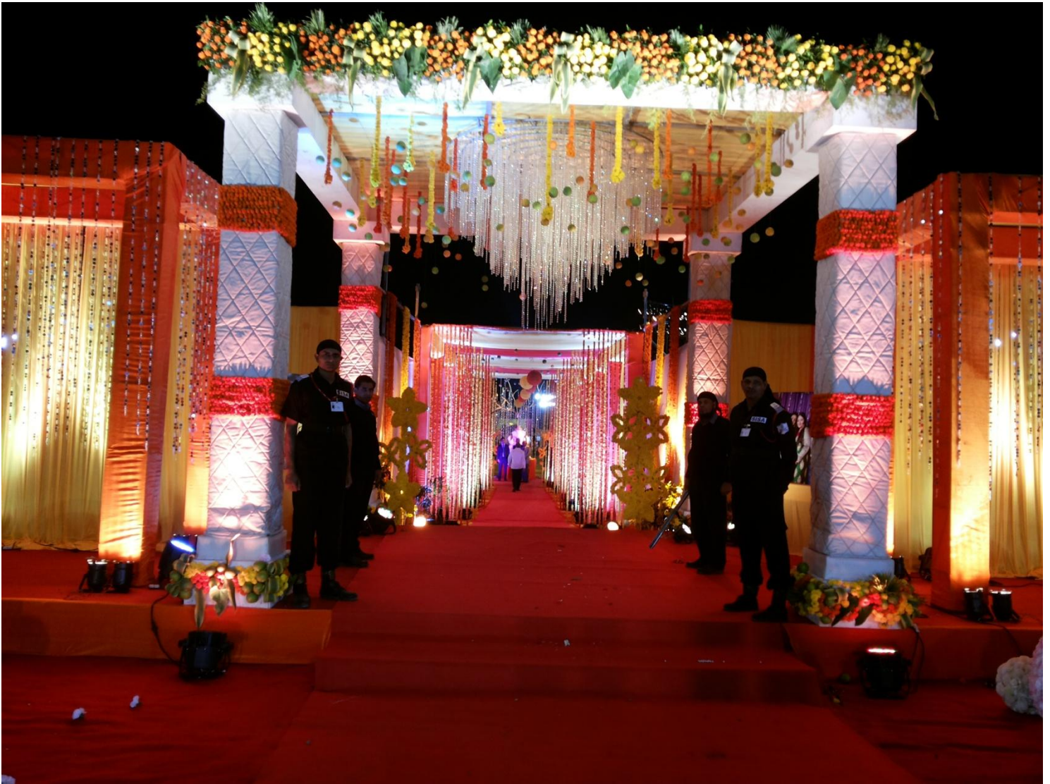
The Marriage function secured by SISA.