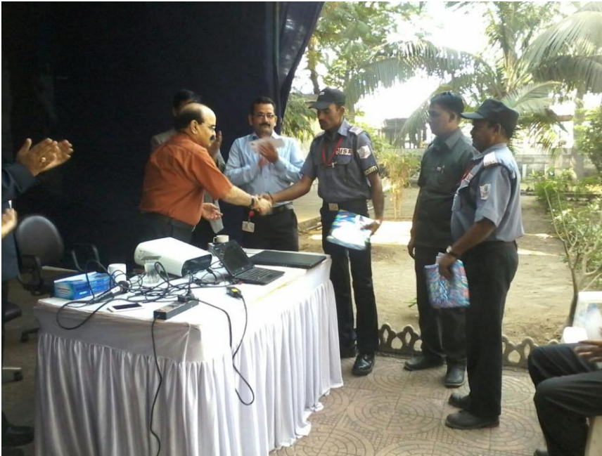
❖ Chairman appreciating our Security guards for catching thieves and saving clients property at Micro Ink , Vapi