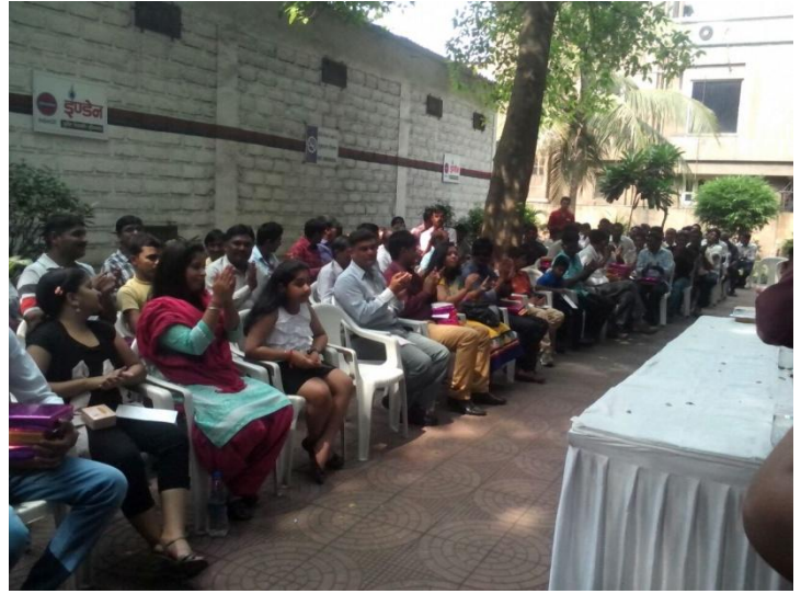
Employees enjoying the New Year Celebrations and Gift Distribution.